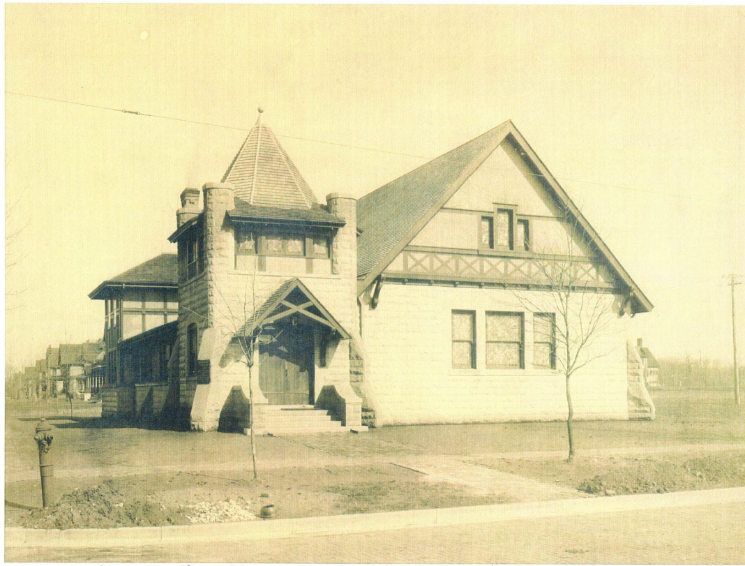
1909 Unitarian Church at Oregon + Mathews, Urbana, IL